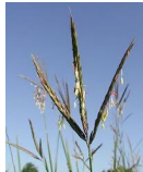
Big Bluestem Grass