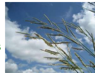
Prairie Cord Grass